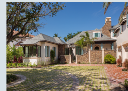
Product Design of the Year, Port Royal