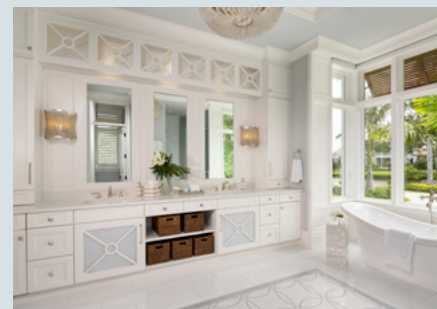
Best Master Suite, Port Royal