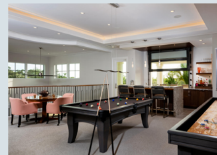
Best Specialty Feature: Game Room and Bar, Audubon