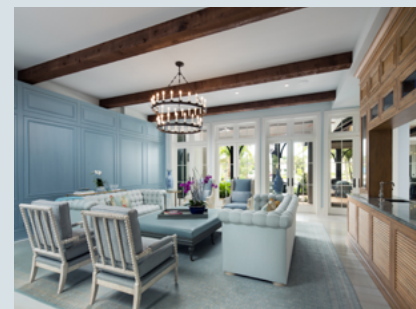
Best Use of Custom Wood, Port Royal

A special thanks to our clients who allowed us to enter their stunning homes into this year's competition. We also want to thank the architects, landscape architects and interior design firms who were key to the success of these homes. We would not have results like these without all team members working together for our wonderful clients!