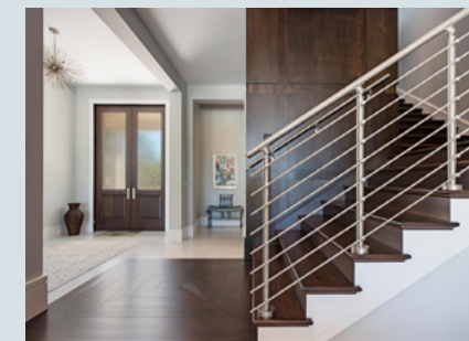
Best Use of Custom Wood, Audubon

BCB Homes is proud to announce that five of our beautifully built and designed custom homes were the proud recipients of the Collier Building Industry Association's Sand Dollar Award! With over 80 companies entering more than 400 projects into the competition, BCB Homes is proud to have been acknowledged for our client's beautiful homes...even multiple awards for three of them!