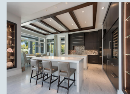
Best Kitchen Design, Audubon

In addition to these nine projects, we also won Product Design in Audubon, Best Pool Design in Port Royal and Best Outdoor Living Area in Port Royal.