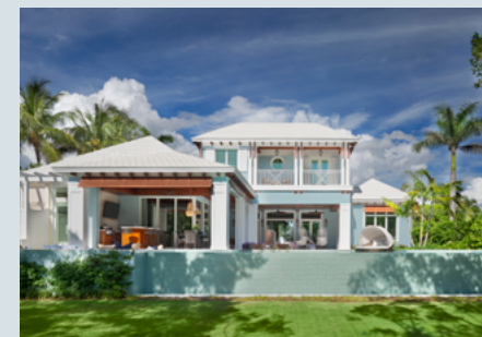
Product Design of the Year, Port Royal