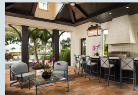
Best Outdoor Living Area, Port Royal