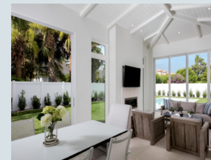
Best Specialty Feature: Outdoor Living Area, The Moorings