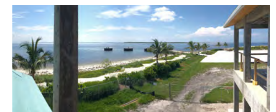
Views of Boca Grande Pass from Silver King Model

BCB Homes is making a big commitment to helping update current homes on Boca Grande, as well as building new homes! We are currently working on wrapping up a remodel to a home in Boca Bay and have two other remodel projects that are in for permit on the island. We also have been establishing a relationship with the Boca Grande Historical Society and the Boca Grande Chamber of Commerce. We look forward to seeing you on the island soon!