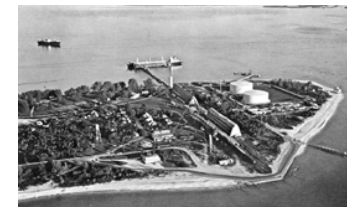
The Phosphate Port and FP&L's facility at "South Dock" circa 1960 and present location of Hill Tide Estates!

The natural geography of Boca Grande makes it the ideal staging ground for tarpon as they head offshore to spawn. Sport fishermen from every corner of the globe come to this 40-foot depth channel between Gasparilla Island and Cayo Costa to witness the phenomenon. This channel is what the development, Hill Tide Estates, overlooks.