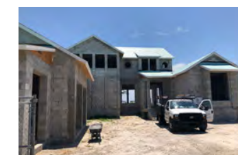
Silver King Model 7.16.18