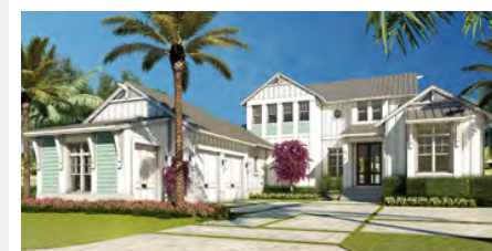
Artist's Rendering of Silver King Model

BCB Homes' current home under construction is the Silver King Model. The home is on track to be completed in early Spring of 2019. Beautifully designed by John Cooney of Stofft Cooney Architects and Ficarra Design Associates, the home has 4 bedrooms, 6 bathrooms and breathtaking views of Boca Grande Pass from almost every room. The home is constructed of all concrete block and will feature a sand float finish with board and batton accents and cypress wood corbels. The custom-designed pool and spa by Koby Kirwin will enhance the relaxed, beachfront living that everyone on Boca Grande desires.