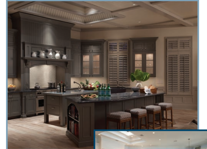
Before & After Photos

There are many reasons for the four to five month lead time. The permitting, material selection and ordering and the design approvals from the Associations are a few. But, there's another very good reason.