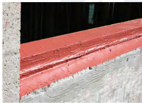
Waterproofing material applied to window opening

High winds and driving rain, no matter what the season, are of no concern to our homeowners' windows because BCB Homes has strict guidelines and proven methods to ensure moisture stays outside where it belongs.