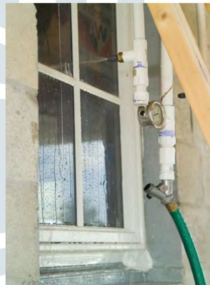
Wash down test