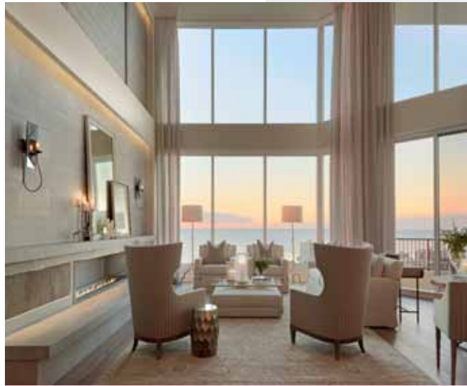
Remodel in Trieste

There are two main groups of home owners that decide to venture into a remodeling project. The first are home owners that recently purchased an existing home in an older, more established neighborhood and they want to make it their new home their own. The second group are home owners that resided at the same residence for a long period of time and have reached the conclusion their home needs to be updated.