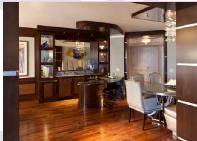
Remodel in The Brighton