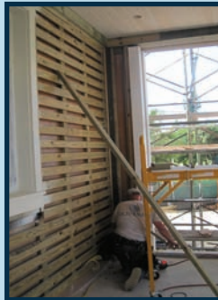
Backing being applied to attach the cedar shingles