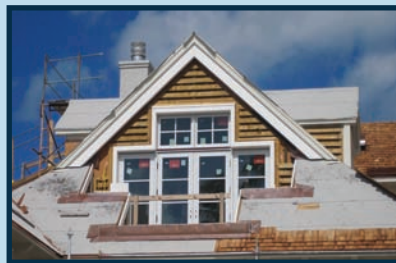
Shingles being installed on the roof