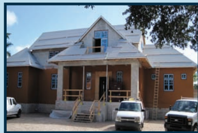
House with the waterproofing material over the concrete block walls

Cedar shingles are higher maintenance in our climate, but it is a beautiful product. The shingles were prestained on all sides by the supplier prior to shipping to protect them. After the shingles are installed an additional coat of stain was applied to the exterior surface only for color and further protection.