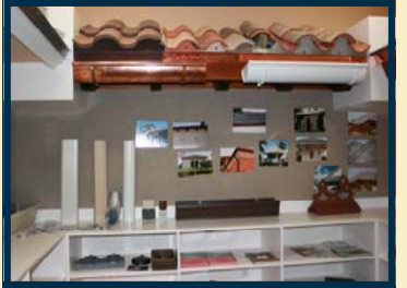
Sample Roofing Materials