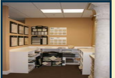
Granite and Stone Samples