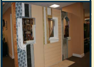
Wall and Window Details