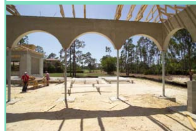
Good Construction Methods vs. Poor Construction Methods