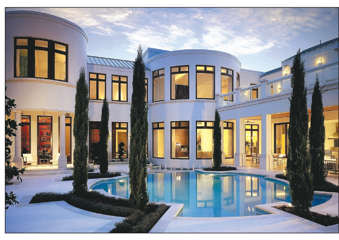
The Product Design of the Year in the Single Family Detached Private Residence over $6,000,001 category was presented to BCB Homes Inc. for this private residence.