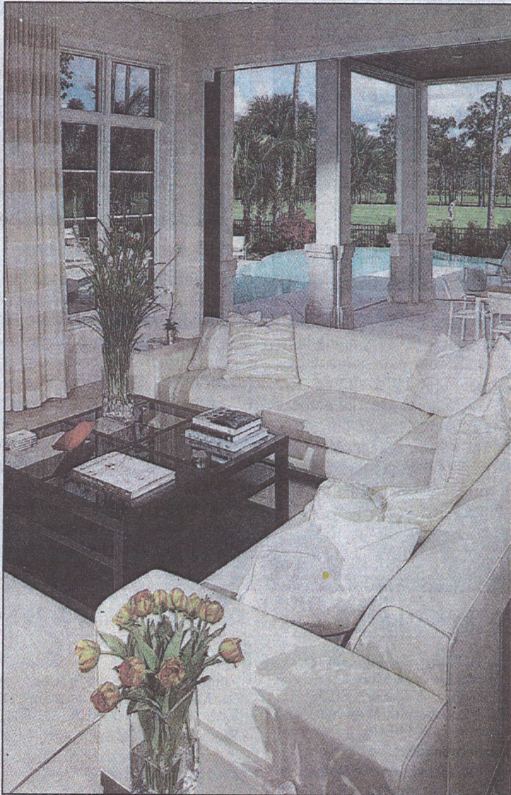
The family room of the Malinsy model opens to the outdoor living area through motorized sliding glass doors, revealing views of the pool and golf course.

Double doors provide an imposing entry for the master suite.