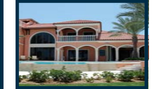
Above: Photo of a home with the standard laminated, tinted glass