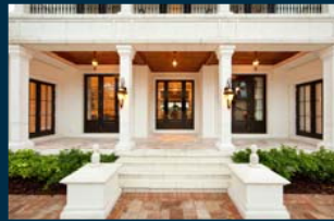
Above & Below: Photos of home with the Low-E glass installed

It is estimated that you can reduce your energy bills by one-third by using low-emissivity glass in your home. The glass comes in all residential sizes, thickness and shapes, as well as being fully customizable for your home and able to meet the impact requirements. Call BCB Homes today to have any questions answered about Low-E glass and to get an estimate to install the Low-E glass into your home!